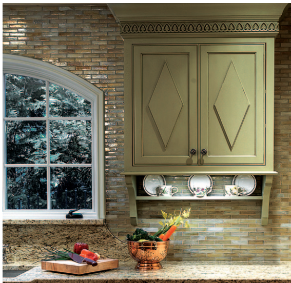
In this kitchen, materials and details come together: the green cabinet to match the homeowner's dishes, a lower shelf to display plates and cups, unique door style and glass tile convey the ultimate in You-nique kitchens.

Honey oak cabinets with beige walls and tan floors just won't do for your kitchen. Think about your favorite color and use it as wall paint. Select a vibrant backsplash tile for a nice jolt of color. Or look at your dinnerware for inspiration in painting an island or hutch piece. Still not sure? Look to your wardrobe—you're probably wearing colors that you love. The point is to surround yourself with shades that make you happy.