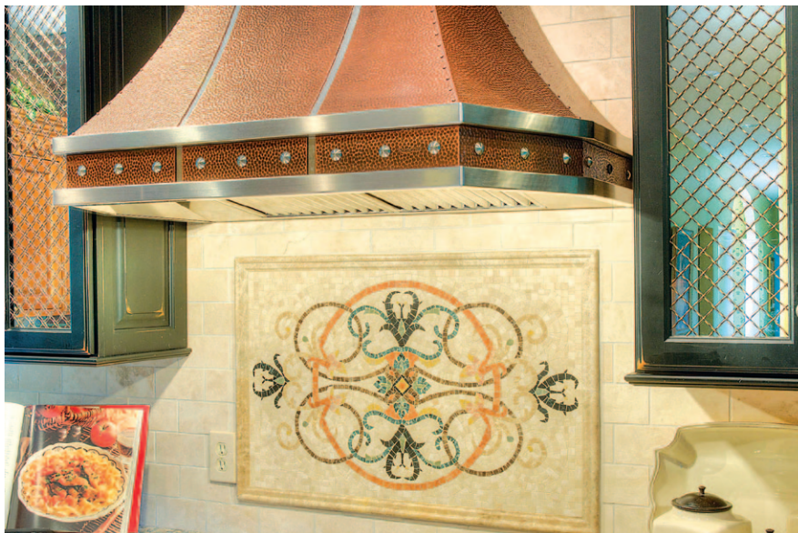
Mixing materials and finishes can make your kitchen shine. Above, a copper hood with rivets is flanked by mirrored cabinetry with brass wire mesh. A custom mosaic completes the design.

Sometimes, the small things can have the greatest impact on setting your kitchen apart from the rest. Pay attention to light fixtures. Countertop edges. The fabric on your chair bottoms. The style of your faucet or cabinetry hardware. These little things can speak volumes about who you are and the message you want to send.