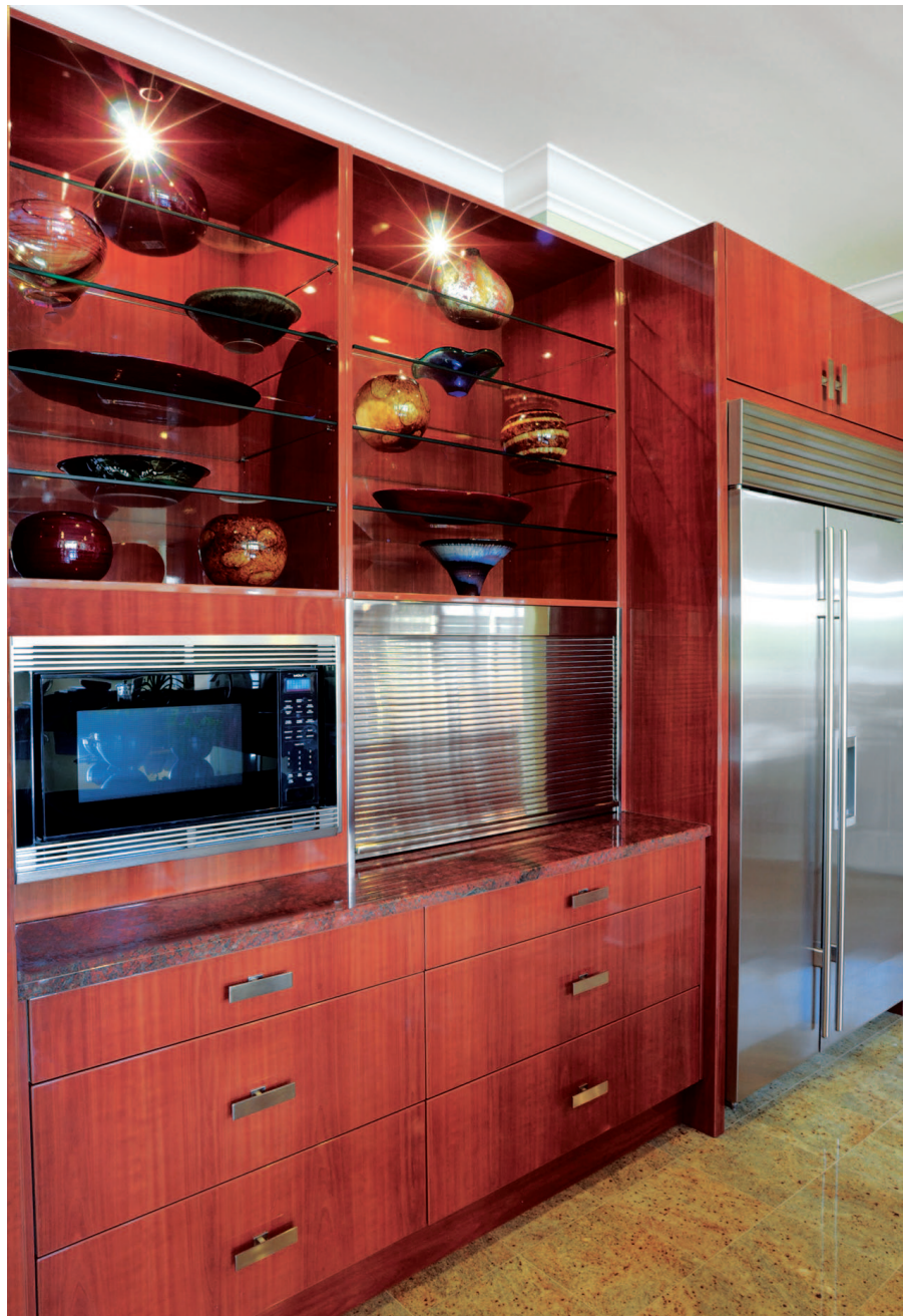
In this kitchen, the homeowner's collection of glass art is a focal point.