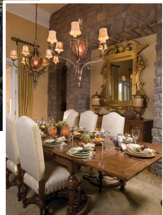
Using two different chairs is a great way to interject another fabric or style into the room.